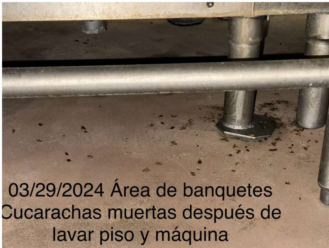
Photo of apparent dead cockroaches in banquet area. Taken by Wendy Bonilla on 3/29/2024

On or about March 29, 2024, Bonilla encountered several dead cockroaches in the banquet dishwashing area. She took a photo of the apparent cockroaches. That photo is below: