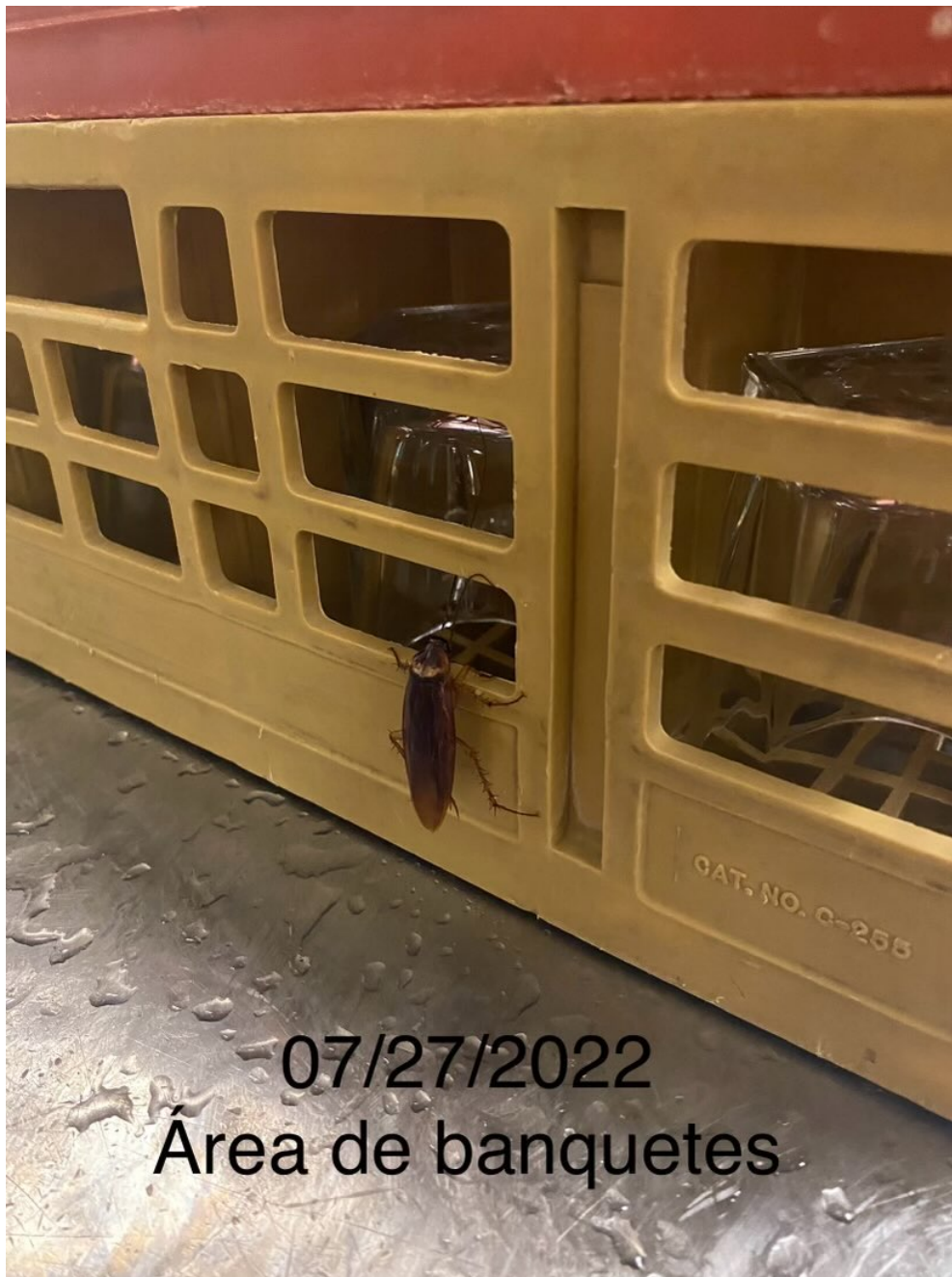
Photo of apparent cockroach in 3rd floor banquet area room, taken July 27, 2022.

On or about July 27, 2022, Bonilla encountered what appeared to be a large cockroach in the third floor banquet area. Bonilla took a photo of the apparent cockroach, which is below: