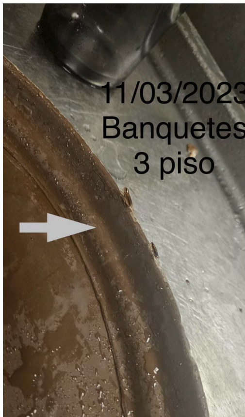
Photo of apparent cockroach in third floor of hotel banquet area, taken November 3, 2023 by Wendy Bonilla.